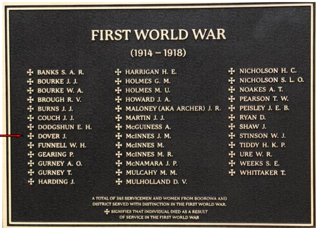
Boorowa ANZAC Memorial